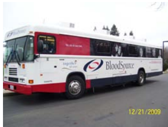
BloodSource bloodmobile located in front of the Sutter County Public Health building... a nice refuge on that rainy Monday!